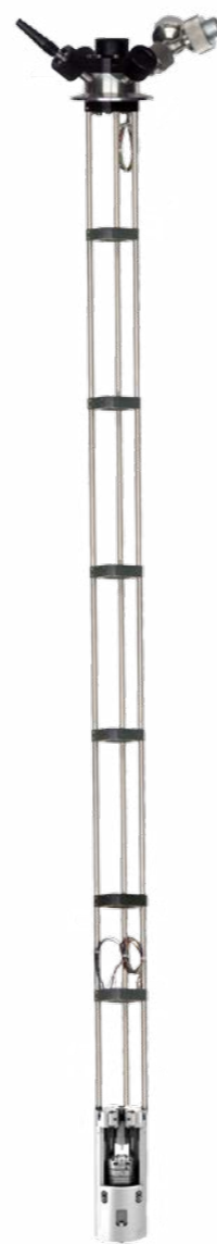
The attoAFM III microscope stick

* Resolution may vary depending on applied tip, sample, and cryostat